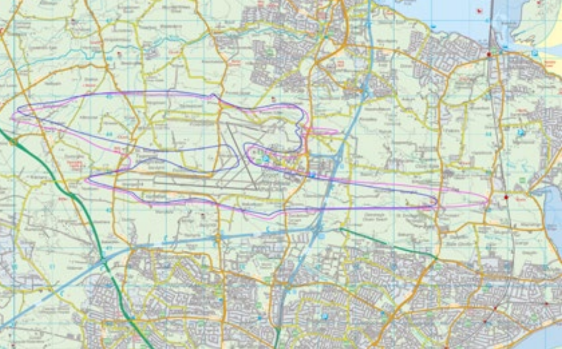
63dB LAeq, 16hr Noise Contour (Current forecast data) — blue 63dB LAeq, 16hr Noise Contour (An Bord Pleanála - 2007) — pink